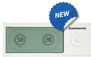
DRC1 remote control

A new developed remote control allows reading and setting of relative humidity and temperature, alarms and service information.