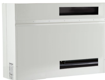
CDP(T) through-the-wall version