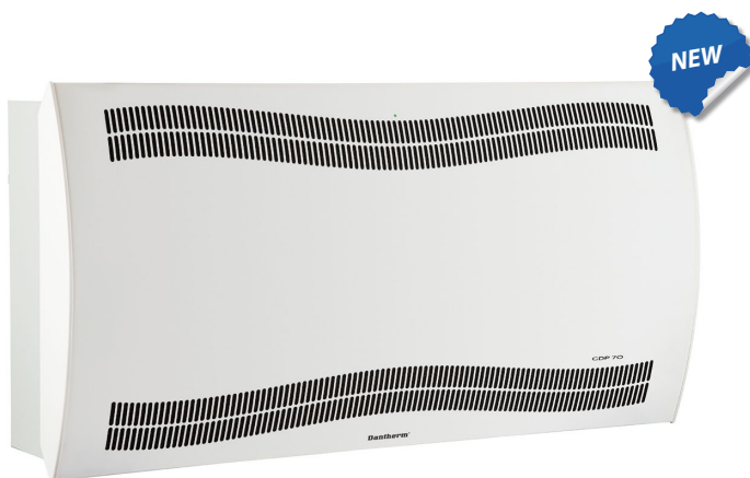
CDP pool room version – wall mounted or floor standing